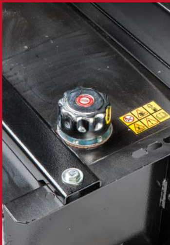
INTEGRATED METAL FUEL TANK (OPTION)