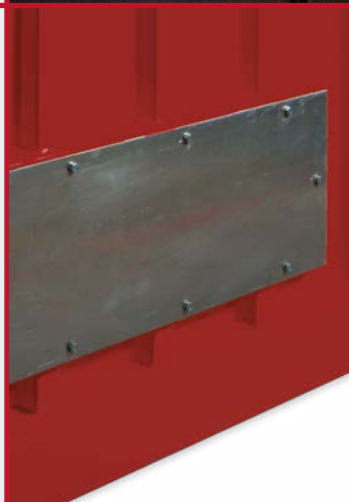
REMOVABLE METAL PLATE FOR POWER CABLE PASSAGE