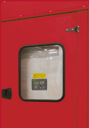
CONTROL PANEL DOOR WITH WINDOW