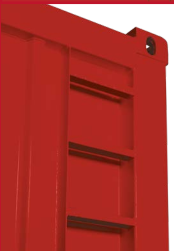
ISO LIFTING HOOKS