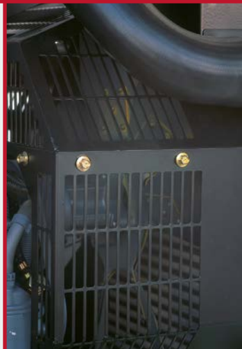
MOVING AND ROTATING PARTS PROTECTION