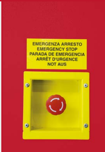
NICHE FOR EXTERNAL EMERGENCY PUSH-BUTTON