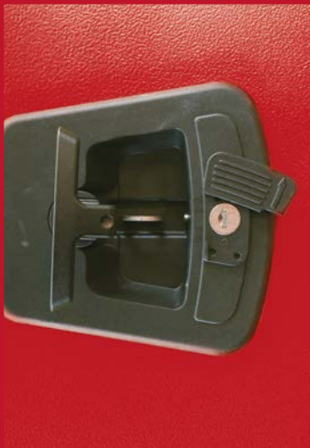
LOCKABLE HEAVY DUTY HANDLE